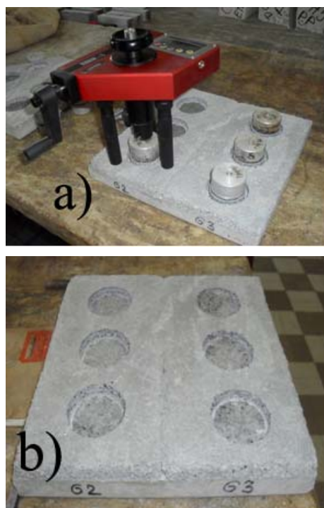
Figure 4 - Pull-off investigation of mortar layer adhesion to concrete substrate – a) apparatus and disks, and b) appearance after the investigation

"Controls", with the tension force increment of 0.5\text{kN/s} \pm 0.1\text{kN/s} . The disposition of this test is shown on Fig. 4.