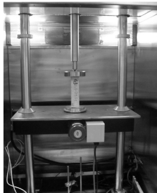
Figure 3 - Determination of modulus of elasticity ( E )

Determination of modulus of elasticity was conducted on prism shaped (4x4x16cm) specimens, after five cycles of loading and unloading in the stress interval between 0.5MPa and f_c/3 ; where f_c is compressive strength measured on the same shaped specimens, at the age of 28 days. The value of the modulus of elasticity ( E ) was calculated on the basis of strain difference measured during the last cycle of loading. The apparatus for this investigation is shown on Fig. 3.