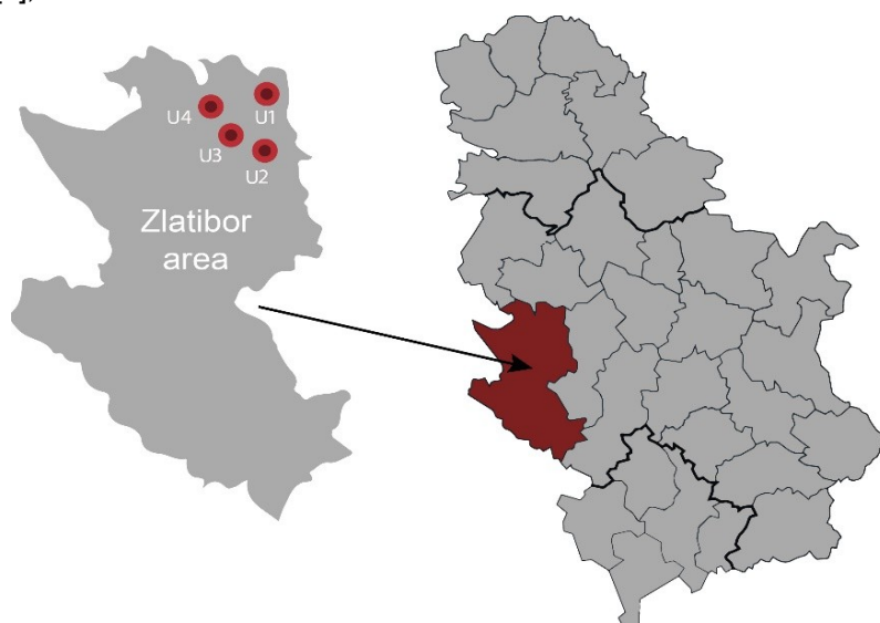
Figure 1. Locations of water samples

The municipality of Požega belongs to the Zlatibor administrative district in Western Serbia (43°50'46"N 20°02'08"E) and covers an area of 426 km 2 . In this study, real water samples from the territory of the municipality of Požega were taken from four locations (Figure 1): tap water in the village of Gornja Dobrinja ( U1 ), tap water in the town of Požega ( U2 ), groundwater from a dug well in Gornja Dobrinja ( U3 ), and water from the drinking water basin in Gornja Dobrinja ( U4 ).