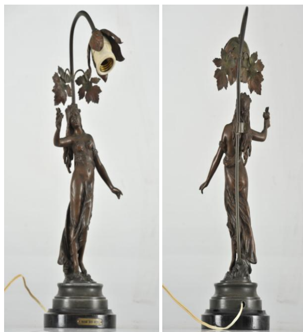
Figure 1. Two views of lamp statue before the arm is broken

The table lamp, however, has a common function, without a kind of heavy loading or simmilar service conditions, but to its owner this lamp has a particular impotrnce from the origin, it is dated from the end of XIX century, as the property of his family. The entire appearance of this lamp, registered before damaging, is shown in Fig. 1, at two views. The body of the lamp is produced by casting, after that is polished. The surface of this lamp is fully decorative protected. brown color originated from a thin copper coating. In the moment of deposition the coating, either it is provided in chemical or electrochemical process,the color might be adjusted by proper chemical contest of used electrolytes.