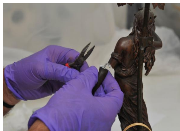
Figure 4. Preparing for reinforcing with aluminum wire