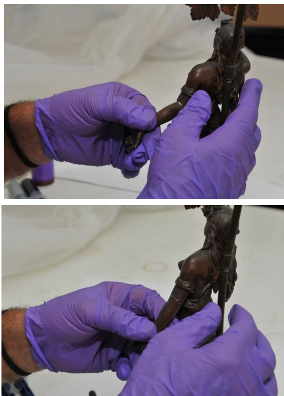
Figure 3. Two views of preliminary assembling of damaged arm to lamp body

The first step in every repair procedure is to assemble the damaged arm to the lamp body. After damaged surfaces were put together, it could be seen that there were no remarkable clearance, because a part of material is crushed but not lost, which commonly is a real case in damaging. Near the damaged surfaces were not found visible deformations on walls around the arm and the body lamp, so such statement is reasonable because the used material (with dendritic structure) has pretty low plasticity, i.e. the material is brittle.